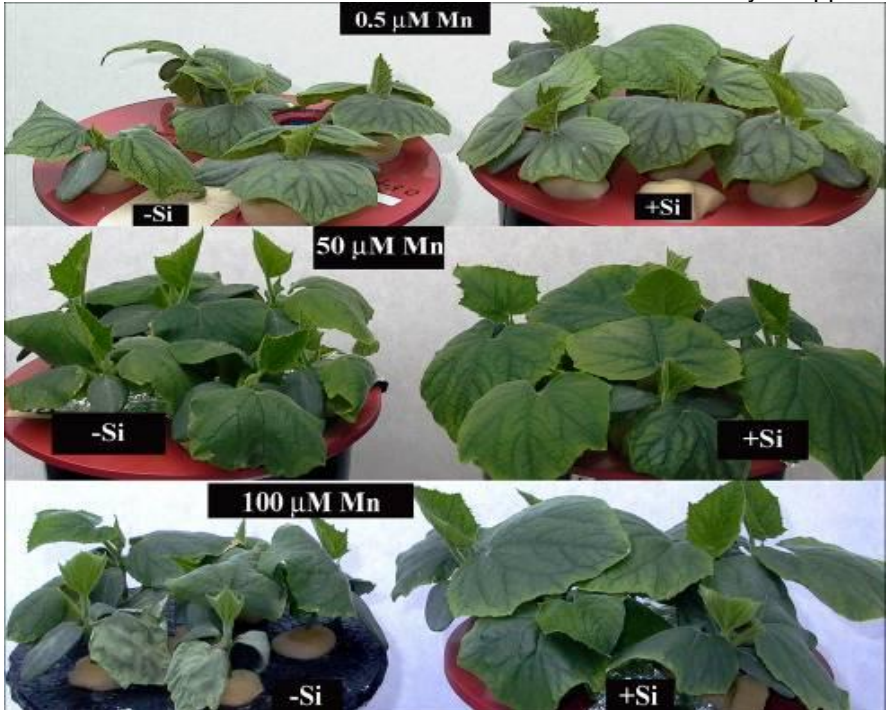
Figure 1 - Effect of root Si supply (1.5 mM) on the development of visible symptoms of Mn toxicity in cucumber leaves

The development of Mn toxicity symptoms in the form of chlorosis with brown spots and small necrotic regions manifested at higher Mn concentrations is reduced by Si application (Figure 1).