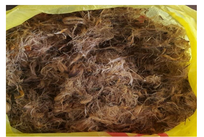
Figure 1. Dried Oil Palm Fruit Fibre. Slika 1. Uzorak osušenih vlakana ploda uljane palme

Figure 1 is a sample of dried oil palm fruit fibre. It was properly dried prior to use for experiment.