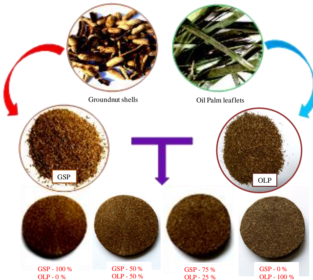
Figure 1. Samples preparation processes

GSP = Groundnut shell particles; OLP = Oil palm leaflet particles